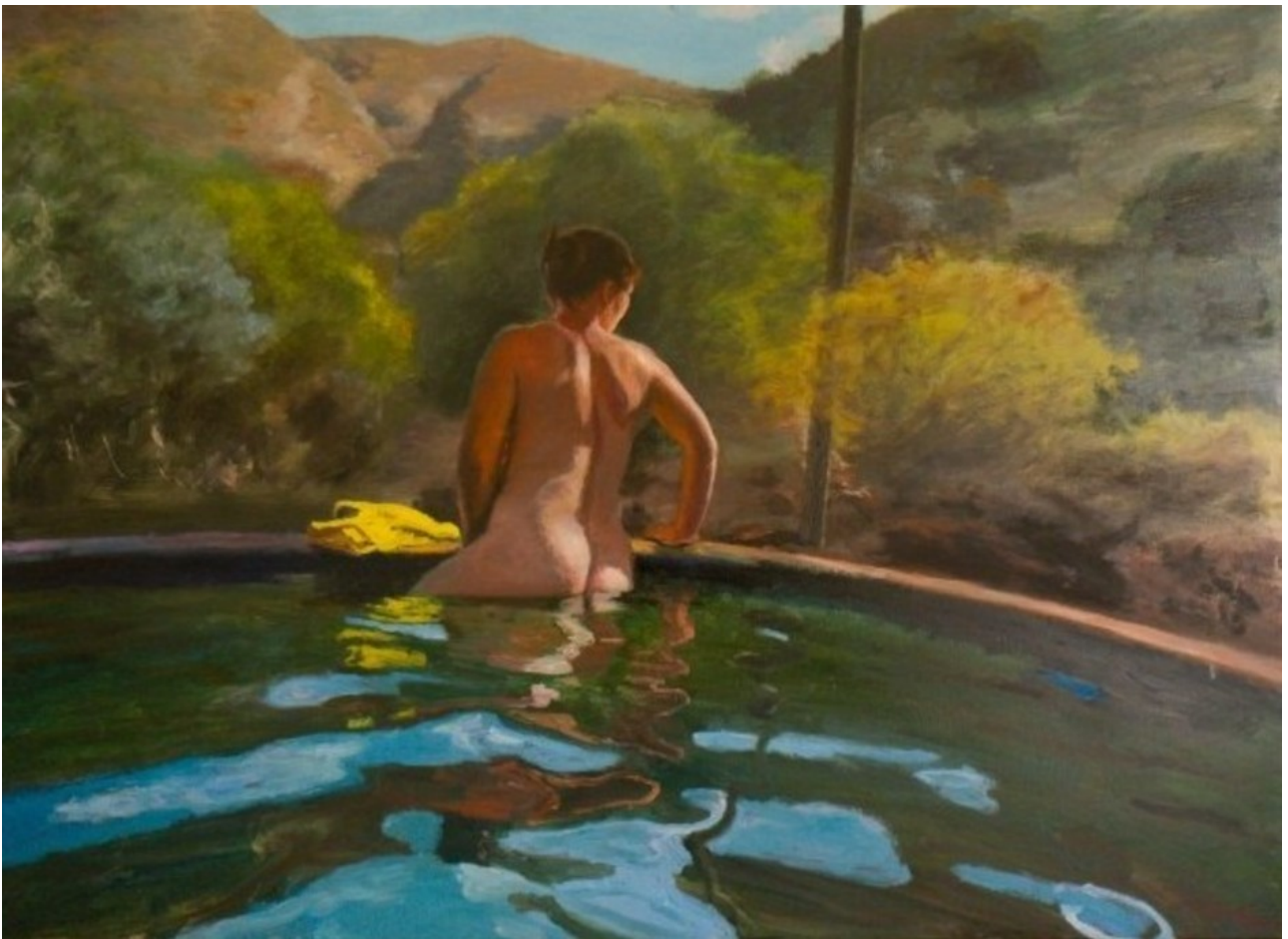
CLARE MENCK Karoo reservoir nude reflected , 2020 Oil on Italian cotton 65 x 90 cm R48,000