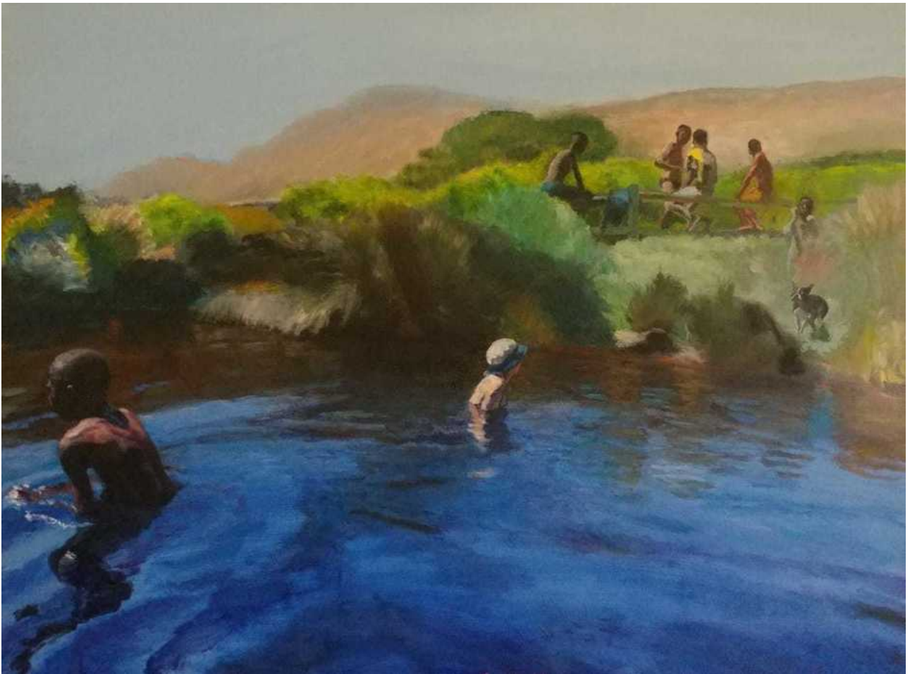
CLARE MENCK Laidback lagoon encounter , 2020 Oil on Italian cotton 75 x 100 cm R55,000